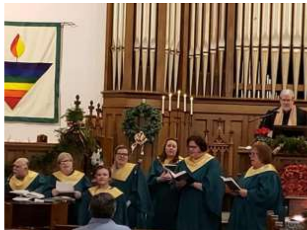
2018 Christmas Eve Choir