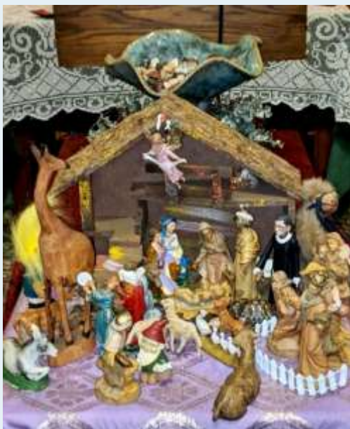
The First Church Christmas Eve Creche

This event is free and open to the public Donations are welcome